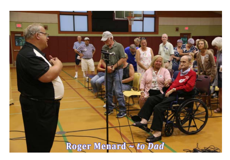
It was ... a special night.